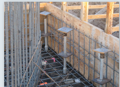
Model 175 tension piles within pile cap