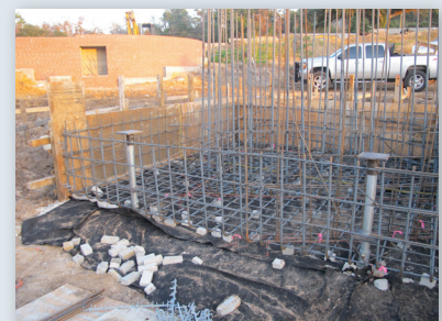
Model 350 compression piles - four tension piles along opposite edge