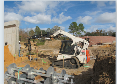
Installing battered Model 175 tension piles