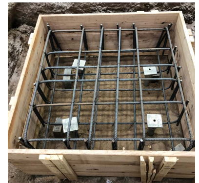
Helical piers with new construction caps and reinforcement