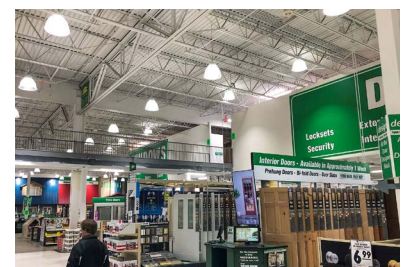
Completed mezzanine addition