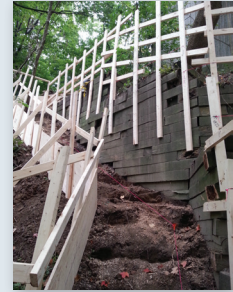
Original wall section with safety fencing

Products Installed: (58) Foundation Supportworks® HP288 Helical Piles, 8”-10” Lead Section, Installed to Depths of 16 to 28 feet, Ultimate Compression Capacity of 110 kN (25 kips); (54) HA150 Helical Tiebacks, 8”-10” Lead Section, 30-degree and 60-degree Installation Angles, Tieback Lengths from 16 to 32 feet, Ultimate Tension Capacities of 110 and 128 kN (25 and 29 kips)