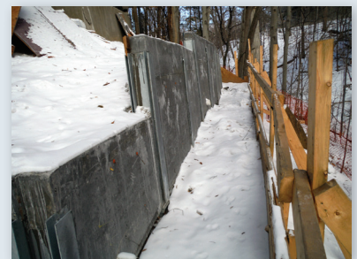
Finished cast-in-place wall face