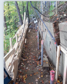
Helical piles and tiebacks installed