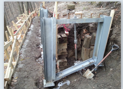
Wall corner detail