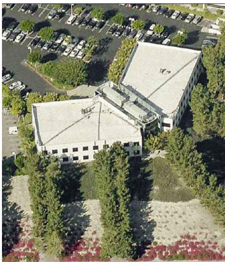
Arial view of the office building showing the slope behind the center patio and south and southeast wall areas

An approximate 38,000 square-foot, two-story office building, constructed in 1991, exhibited significant wall and floor slab movement by 2016. A manometer survey performed in 2016 indicated about 4-½ inches of differential settlement at the south and southeast section of the building and up to 1-¼ inch cracks along the south and southeast wall and ceiling areas. The building construction consisted of exterior concrete tilt-up panels and interior steel columns, both supported on shallow foundations. Glass wall panels were also located along the exterior walls with some