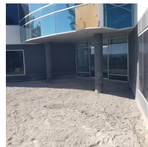
Pier locations backfilled and compacted at center patio area

the void space created under the footings and interior floor slab was filled with 2,900 pounds of PolyLevel® PL400. PolyLevel® PL400 is a two-part liquid urethane that is mixed and injected through 3/8-inch holes drilled through the slab to expand into a rigid foam and serve as a very