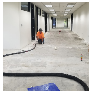
PolyLevel injection at interior floor slab