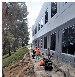
Piers being installed along the southeast wall