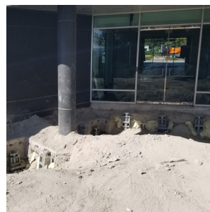
Push piers, anchors and PolyLevel installed at center patio area