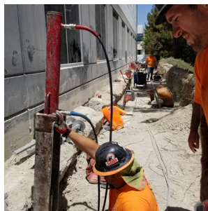
Installing push piers along the south wall

The lift operations recovered about 1-3/4 inch of the initial settlement. Following the push pier lift and lock-off operations,