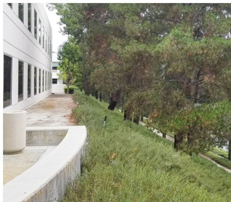
Access conditions along the southeast wall

Based on the manometer surveys and the geotechnical borings, the source of the settlement was determined to be from foundation movement at the south and southeast exterior walls due to the deep fill at this area of the site. Given the amount of settlement and misalignment of the