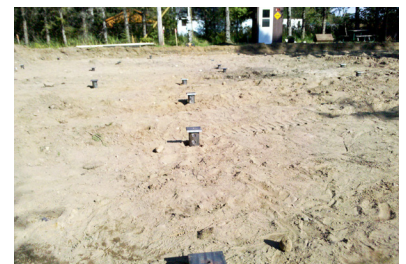
Completed piles and brackets