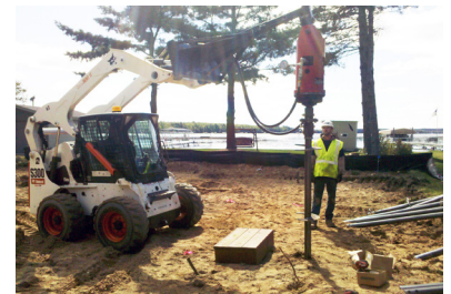
Advancing lead section of 3.5-inch O.D. pile