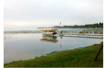
Soils on property included dredged material from bay

Products Installed: (14) Supportworks® Model 288 Helical Piles, 10"-12"-14" Lead Section; (26) Supportworks® Model 349 Helical Piles, 10"-12"-14" Lead Section Followed by Single 14" Extension; Piles Installed to Depths of 27 to 40 feet, Design Working Loads Ranging from 6.7 kips to 32 kips