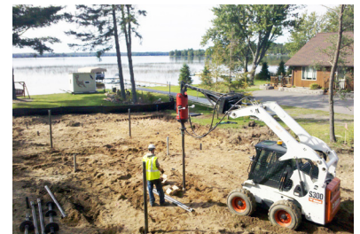
Piles advanced to refusal in the deep gravelly sand