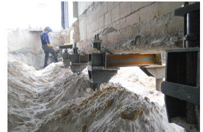
Steel beams welded to retrofit brackets