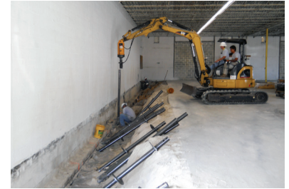
Vertical piers installed inside warehouse