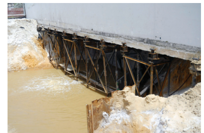
Excavation of contaminated soil. Building stabilized with helical piers.