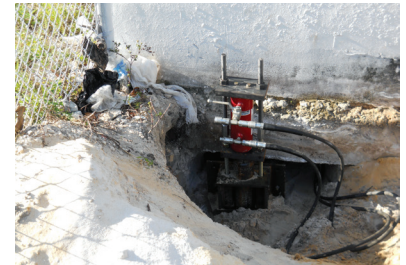
Hydraulic cylinders preload piers before excavation